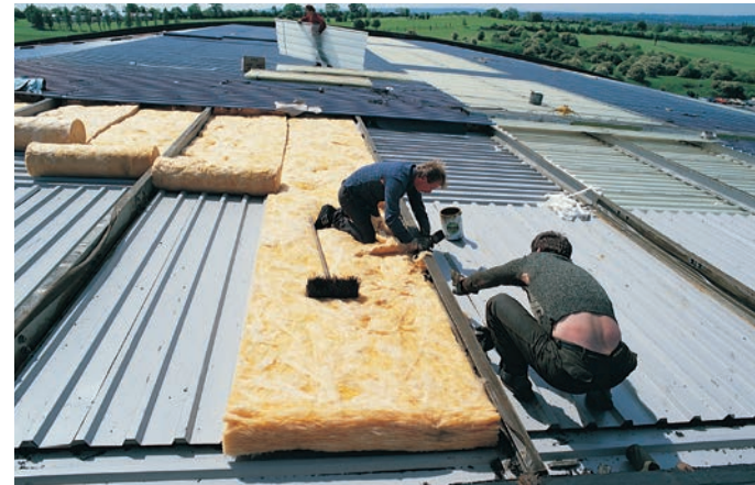
Premier Acrylic Tape prevents galvanic corrosion on 7.5 acre roof of refurbished aircraft hangar, UK.