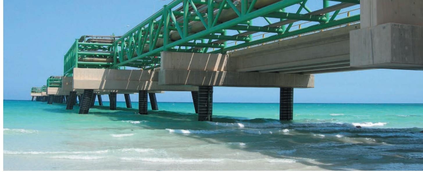
SeaShield™ system protecting jetty piles, Libya.