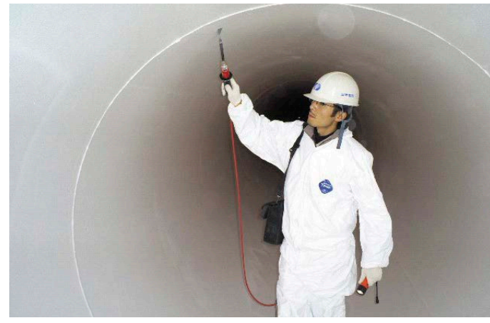
Archco™ Liquid Reinforced System protects a tank's internal surfaces, Korea.