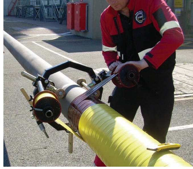
Application of two Premier tapes simultaneously using a Premier wrapping machine.