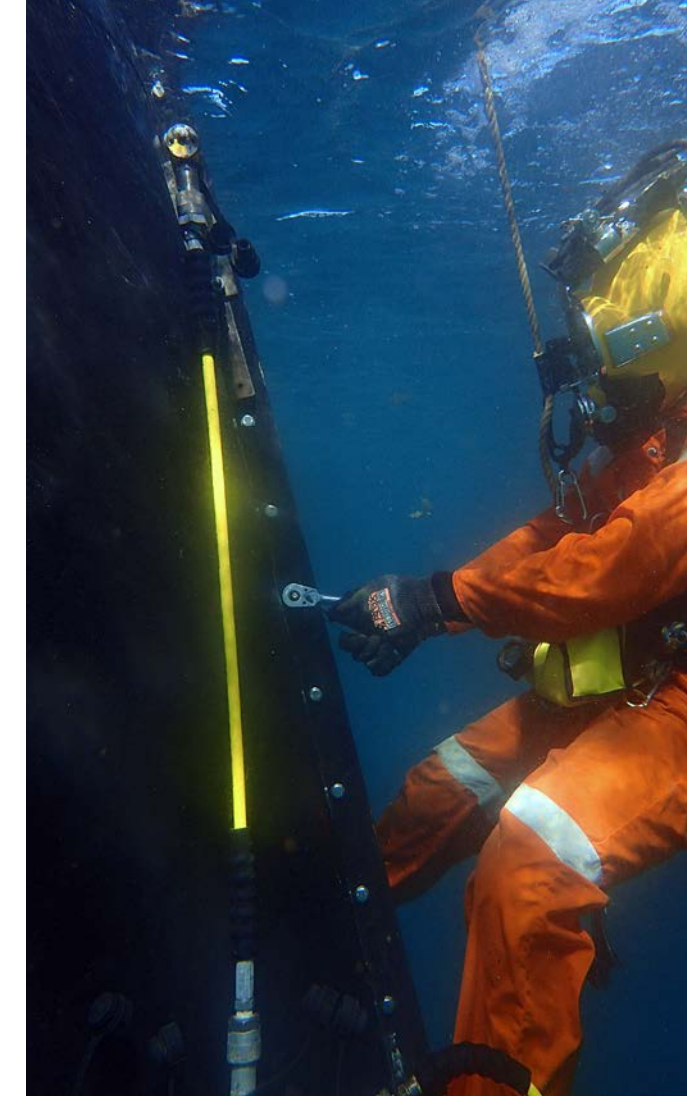
SeaShield 2000FD™ Jacket applied to jetty pile, Australia.