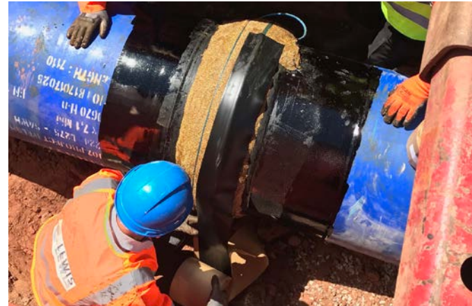
Application of Premier P2 System™ to water pipeline, UK.