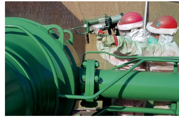
Protal 7200™ spray applied to pipeline valve in Dubai, UAE.