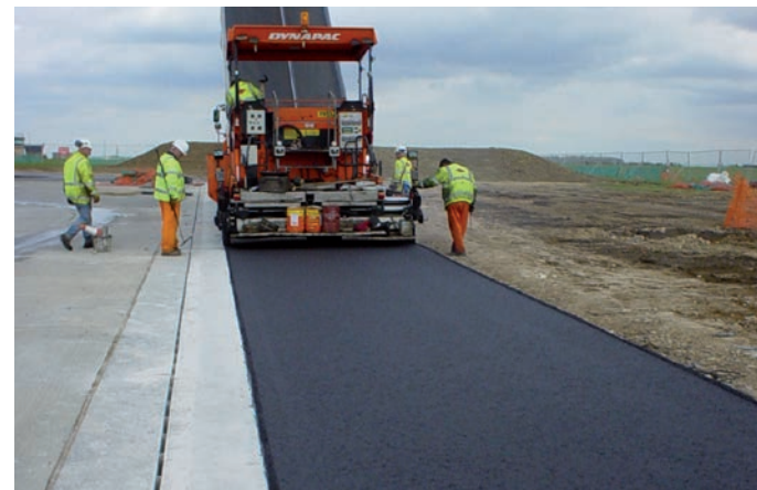
Runway re-surfacing, UK, mastic asphalt joints sealed with Premier Road System.