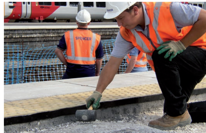
Concrete to asphalt platform joints sealed with the Premier Road System, UK.