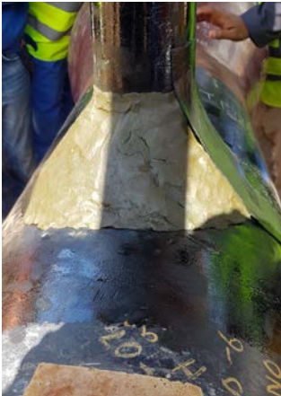
Premier Moulding Compound™ creates smooth profiles for wrapping.