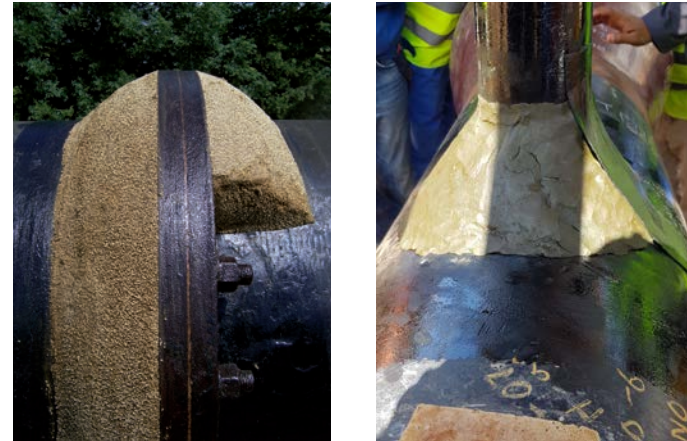
Application of Premtape LD Mastic™ to a pipe flange.