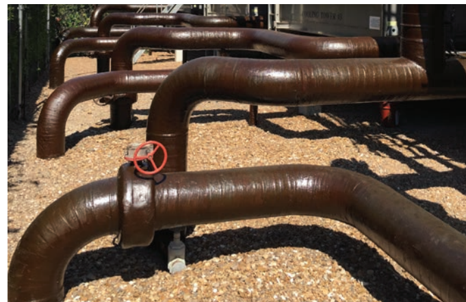
Premtape™ Petrolatum Tape protects cooling tower pipes.