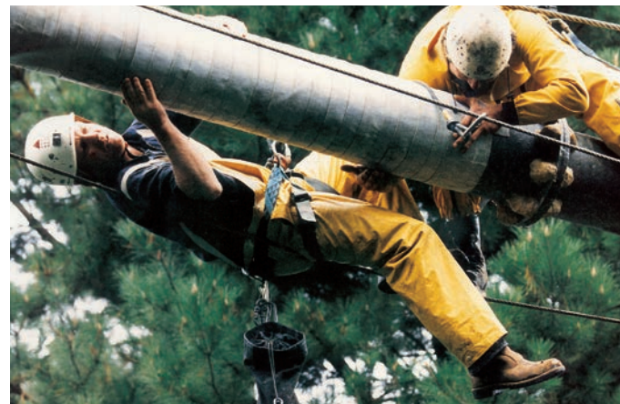
Steelcoat™ System applied in-situ to protect aerial pipelines, New Zealand.