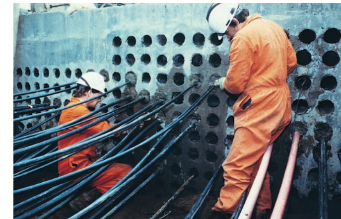
Electrical cable duct entries at UK ethylene plant, sealed with Premier™ Moulding Compound.