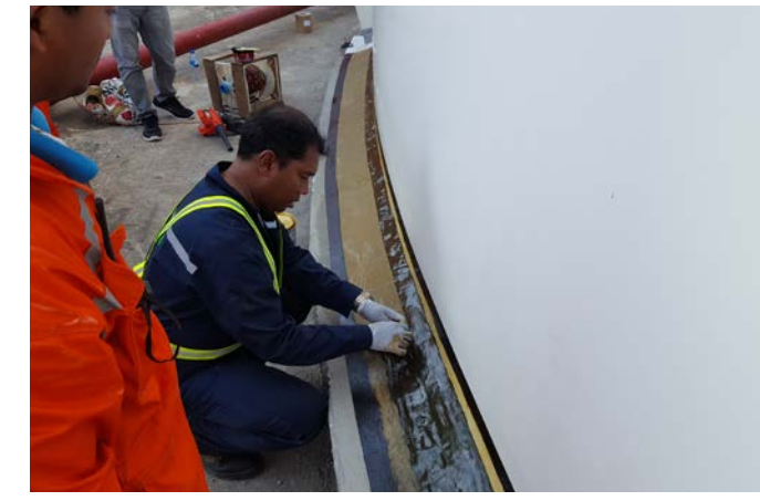
Application of Steelcoat™ Tank Base Protection System, UAE.