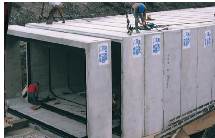
Premstrip™ Joint Sealant for precast concrete box culverts, UK.