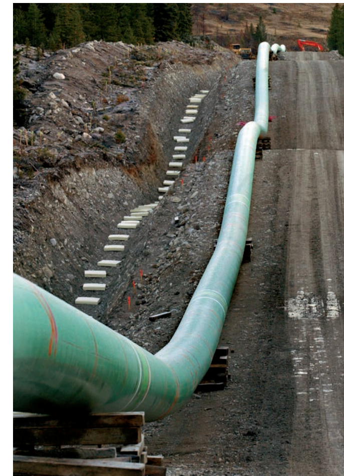
The welded joint areas on this North American pipeline are protected with a Protal™ Liquid Coating System.