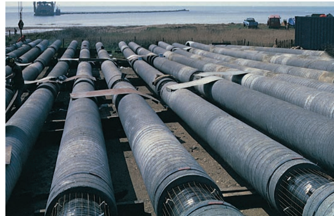
Subsea joints of sea-outfall, Atlantic Ocean, protected with Premcote™ Marine Tape System.