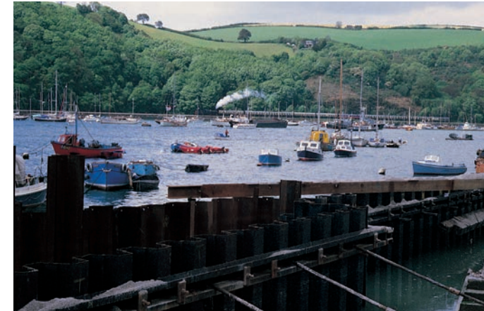
Premier Tie-Bar System protects Atlantic Ocean sea defences against corrosion.