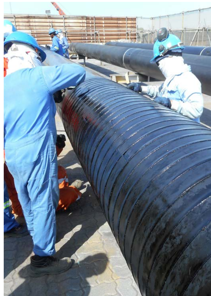
Premcote 450R Tropical™ applied to oil pipelines in the United Arab Emirates.