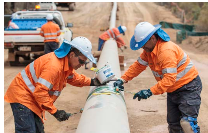
Protal 7200™ liquid coating applied to Field Joints, Australia.