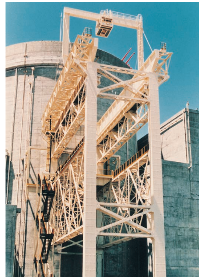
Steelcoat™ System protects steelwork and service pipes of gantry crane, South Africa.