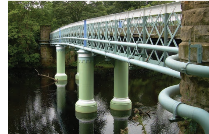
Water pipe bridge, UK, protected with a Steelcoat™ System, applied in-situ without grit blasting.