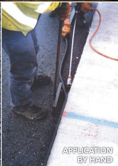
APPLICATION BY HAND