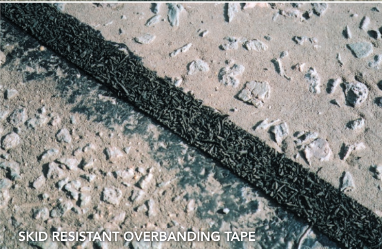
SKID RESISTANT OVERBANDING TAPE