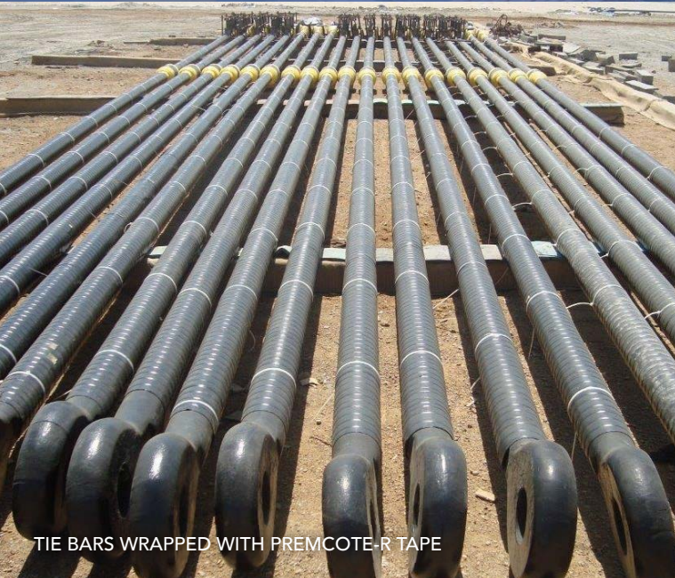
TIE BARS WRAPPED WITH PREMCOTE-R TAPE

A cold-applied self-supporting mastic recommended for use on turnbuckles. This is an optional addition.