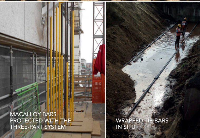
MACALLOY BARS PROTECTED WITH THE THREE-PART SYSTEM