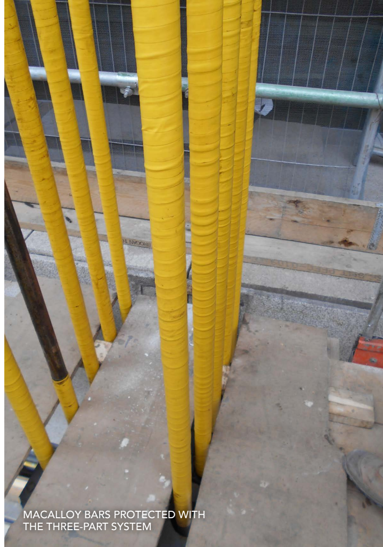
MACALLOY BARS PROTECTED WITH THE THREE-PART SYSTEM

Finally, spirally wrap the Premier PVC Self-Adhesive Tape with a 55% overlap. Ensure that there are no air pockets or voids and that all the tape edges are sealed down.