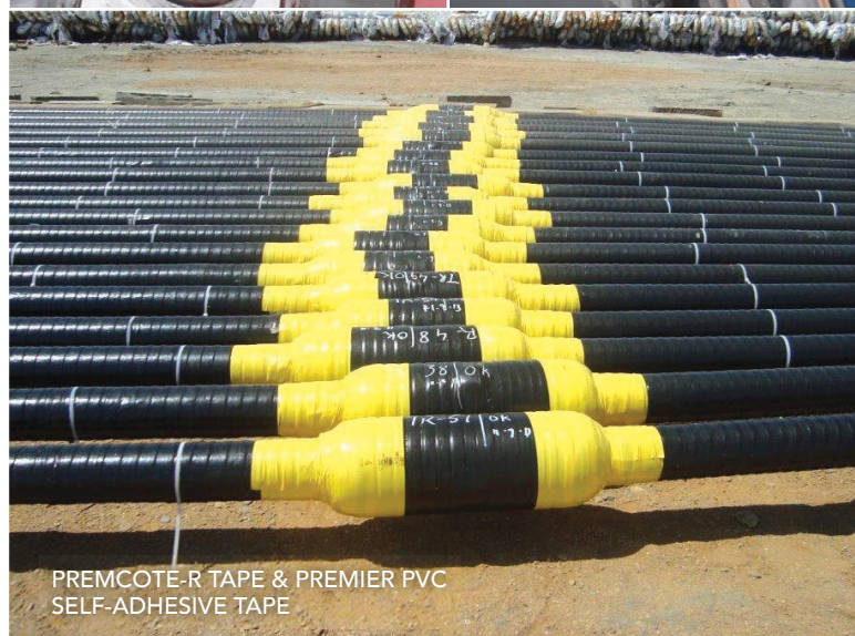
PREMCOTE-R TAPE & PREMIER PVC SELF-ADHESIVE TAPE